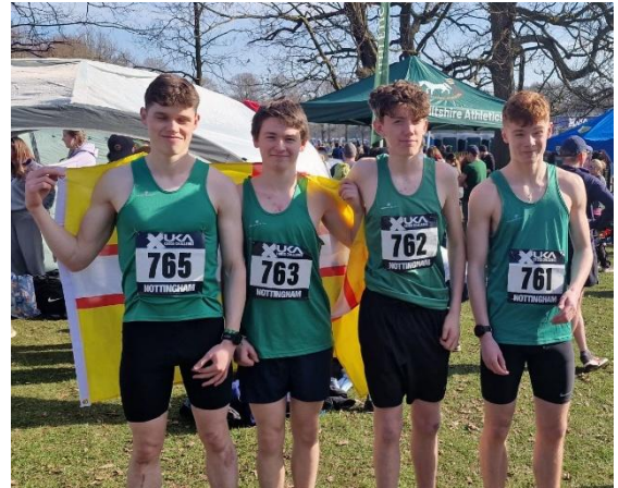
Dorset Under 20 Mens Team