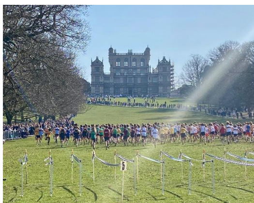
The start at Wollaton Park