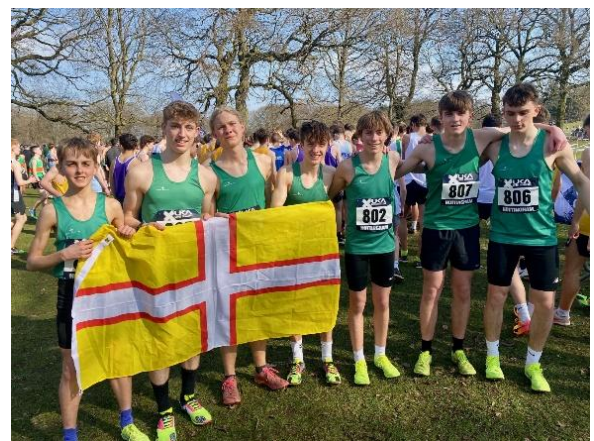
Dorset Under 17 Men's Team