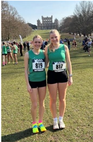
Dorset Under 20 Womens Team