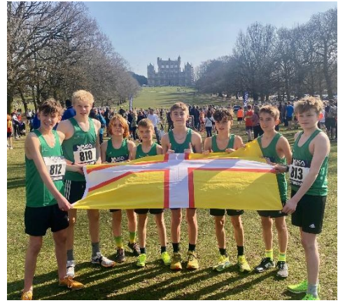
Dorset Under 13 Boys Team