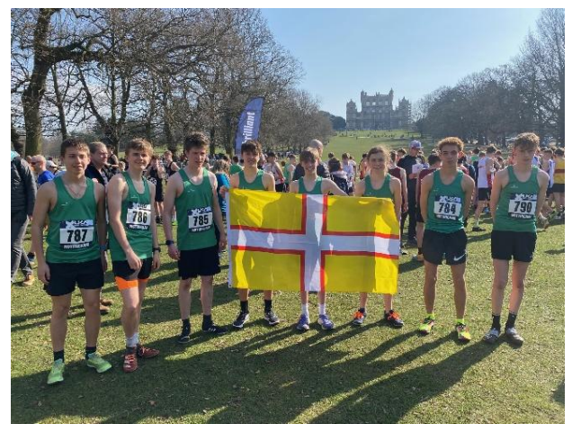
Dorset Under 15 Boys Team