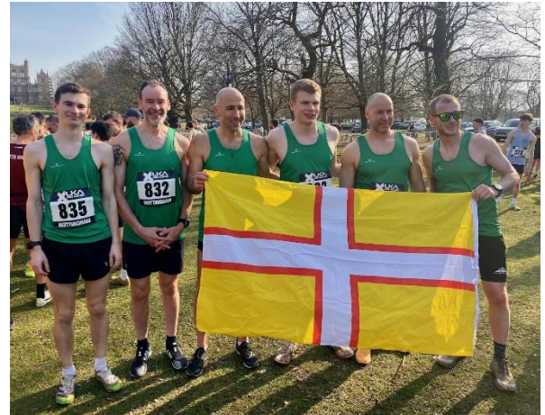
Dorset Senior Mens Team