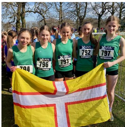
Dorset Under 17 Women's Team