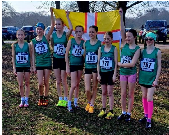
Dorset Under 13 Girls Team