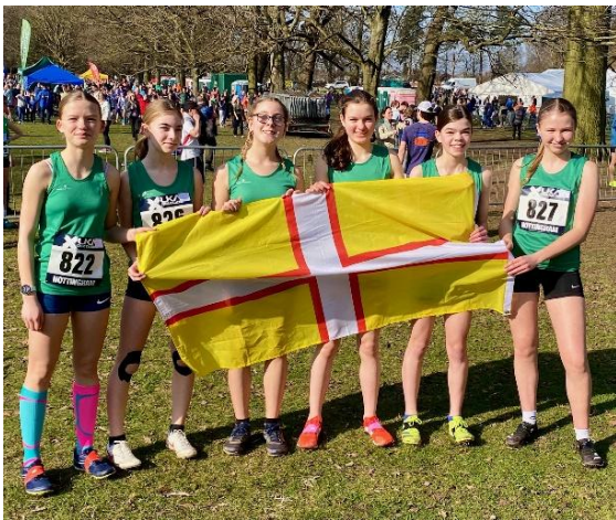
Dorset Under 15 Girls Team